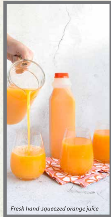
Fresh hand-squeezed orange juice