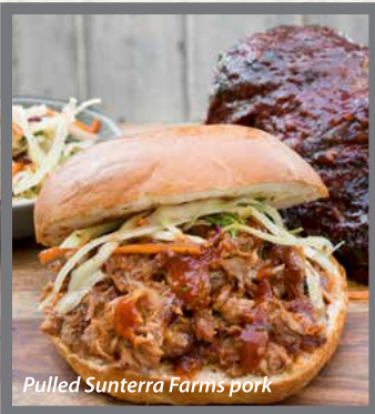
Pulled Sunterra Farms pork