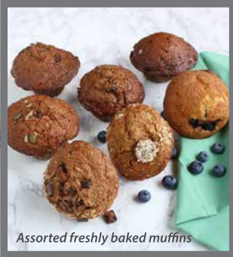
Assorted freshly baked muffins